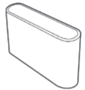
12 x Sleeve