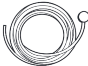
2 x Cable